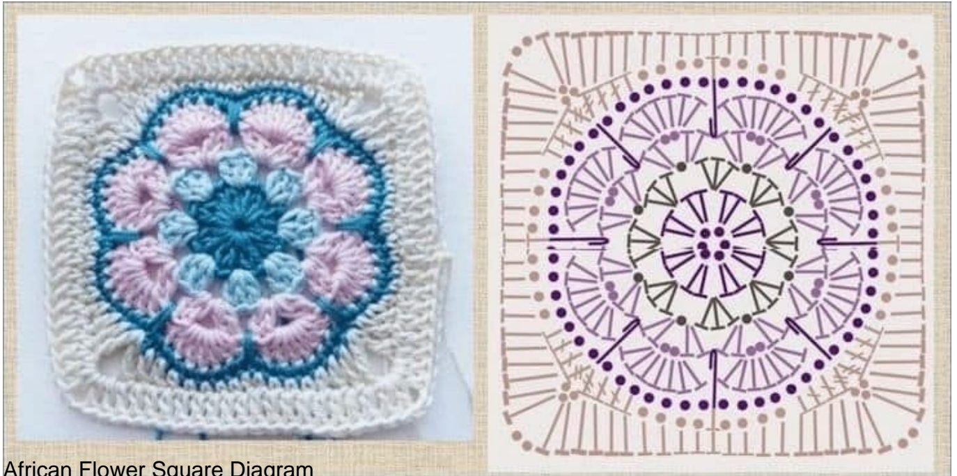
African Flower Square Diagram