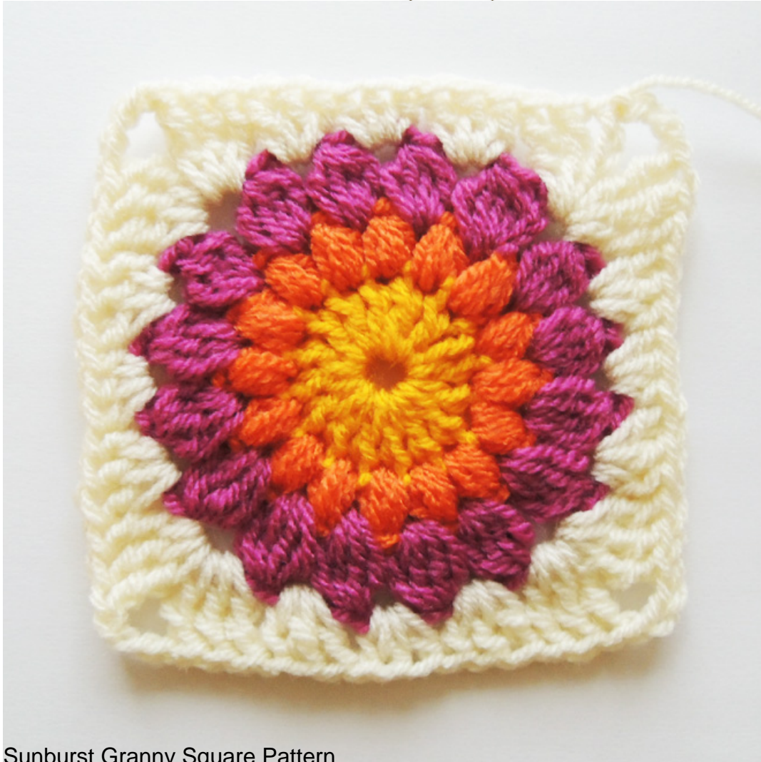
Sunburst Granny Square Pattern